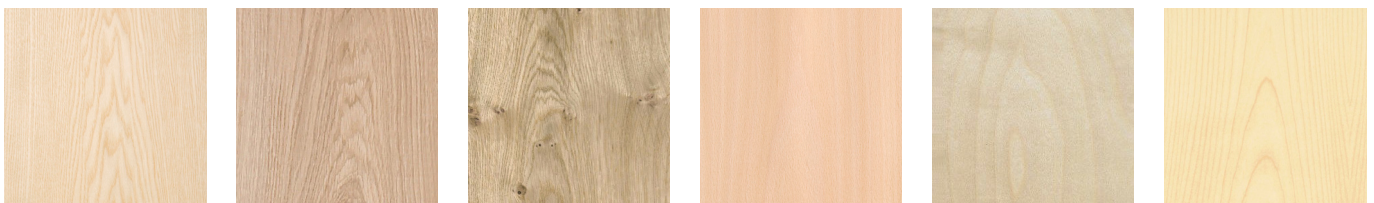
European Ash White